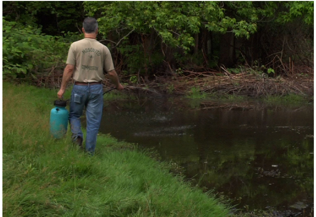
Applying a pesticide to mosquito breeding ground site in waterbody in Monmouth County, NJ.

When it comes to honey bees, synthetic pyrethroids, introduced in the 1960s, are generally highly toxic. In spite of this, mosquito control officials commonly say that pyrethroids pose minimal risk to bees due to their low application rates in the field and claimed repellent properties. 30 However, real-world and laboratory evidence dispute this. Pyrethroids are frequently associated with bee kills and colony collapse disorder (CCD)-like symptoms, characterized by bees’ disappearance from their hives. 31 One study reports that after exposure to sublethal levels of permethrin (0.009 micrograms/bee), worker bees failed to return to the hive at the end of day, while only 43% of these bees were eventually able to return to the hive because of disorientation due to treatment. 32 Pyrethroids have also been found to significantly reduce bee fecundity, decrease the rate at which bees develop to adulthood, and increase their immature periods. 33 A 2015 study finds that exposure to pyrethroids reduces bee movement and social interaction. 34 This study also found that pyrethroid-exposed bees travel 30-71% less