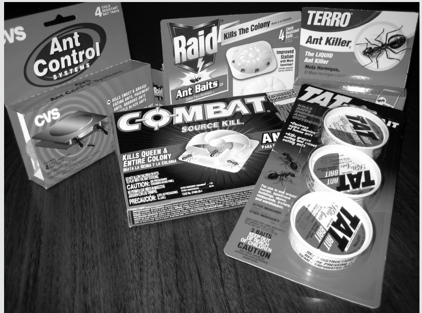
These five baits available for over the counter purchase contain the following active ingredients (clockwise from top left): sodium tetraborate pentahydrate & boric acid, avermectin, sodium tetraborate decahydrate, propoxur, and hydramethylnon.

FC Professional Insect Control Ant Bait Stations (fipronil), Drax Liquidator Ant Bait (boric acid), Gourmet Ant Bait Gel (disodium octaborate tetrahydrate), Niban-FG Fine Granular Bait (boric acid), Terro-PCO Liquid Ant Bait (sodium tetraborate decahydrate), Prescription Treatment® brand Advance® 360A Dual Choice® Ant Bait Stations (abamectin), Transport™ Ant Bait (acetamiprid), Combat® Ant Products (fipronil), Hasta La Vista, Ant!™ (boric acid), Prescription Treatment® brand Advance™ Dual Choice® Ant Bait Stations (Formula 1) (sulfluramid), Maxforce Professional Insect Control Roach Bait Stations (fipronil), Advion Cockroach Gel Bait (indoxacarb), Prescription Treatment® brand Avert® Cockroach Bait Stations Formula 1 (abamectin), Cleary Roach Terminal (a.k.a. Ecologix Roach Bait) (oxypurinol & xanthine), Focus® Termite Attractant (corn oil), Firstline® GT Plus Termite Bait Station (sulfluramid), Firstline® Termite Bait Station (sulfluramid), Advance® Compressed Termite Bait System (diflubenzuron), Recruit™ IV Termite Bait (noviflumuron), Requiem® Termite Bait (chlorfluazuron), Subterfuge® Termite Bait (hydramethylnon)