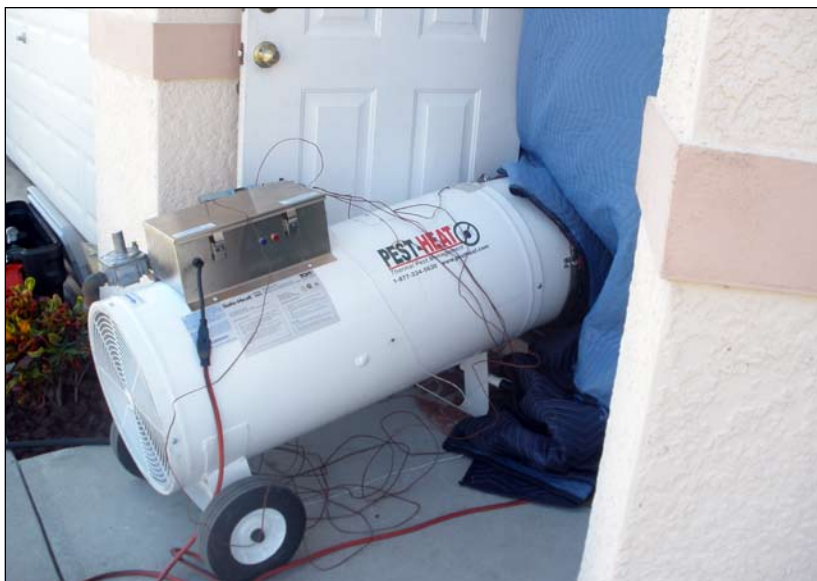
Pest Masters of Ft. Meyers, FL is one of many companies that recognize heat treatments are an effective tool in controlling bed bugs.

Opening drawers and peeling carpet away from baseboards can help this process. This method will work best after clutter has been eliminated, thorough vacuuming has taken place, and clothing/fabrics have been laundered and enclosed in a sealed plastic