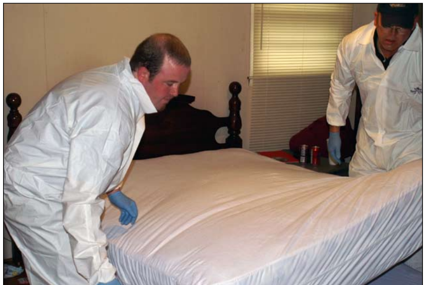
Installing ProtectaBed bedbug proof mattress encasement.

Items that are badly infested may be discarded; however, with the many management options avail-