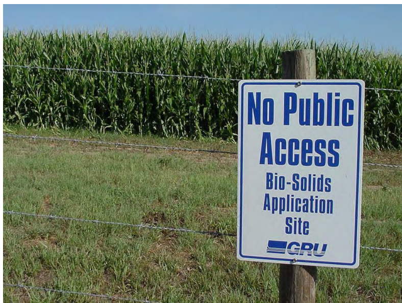
Application site advisory sign.

As the discussion around biosolids rages on, innovators have focused on alternatively using biosolids as a renewable energy source, arguing that biosolids can displace fossil fuels for powering waste water treatment plants, reduce dependence on oil, reduce costs for energy and demand on the power supply, and solve