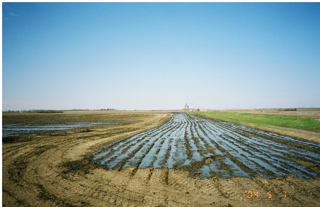
Biosolids application site in Saskatoon, Canada. After the treatment process, the biosolids are stored in asphalt-lined storage cells until the spring and fall when they are spread on nearby farmers’ fields by a process called liquid injection. Image Courtesy City of Saskatoon, Canada. http://bit.ly/TKdjSc .

EPA regulates pesticides under the Federal Insecticide, Fungicide, and Rodenticide Act (FIFRA), which requires EPA to ensure that pesticides do not pose unreasonable risk to human health and the environment. EPA has interpreted its authority under FIFRA’s “unreasonable adverse effect” standards by conducting risk assessments on pesticides. Unfortunately, EPA’s risk assessment process does not fully take into account the environmental fate and effect of pesticide use and the potential risks of pesticide reintroduction into the environment via biosolids, especially those pesticides that are persistent, and cannot be removed from sludge through treatment outlined in the Biosolids Rule . Additionally, pesticide residues which make their way into crops grown in biosolids, contaminate food. These residues must then adhere to standards set by the Food Quality Production Act (FQPA), which regulates the residue allowed on crops with tolerance levels. However, pesti-