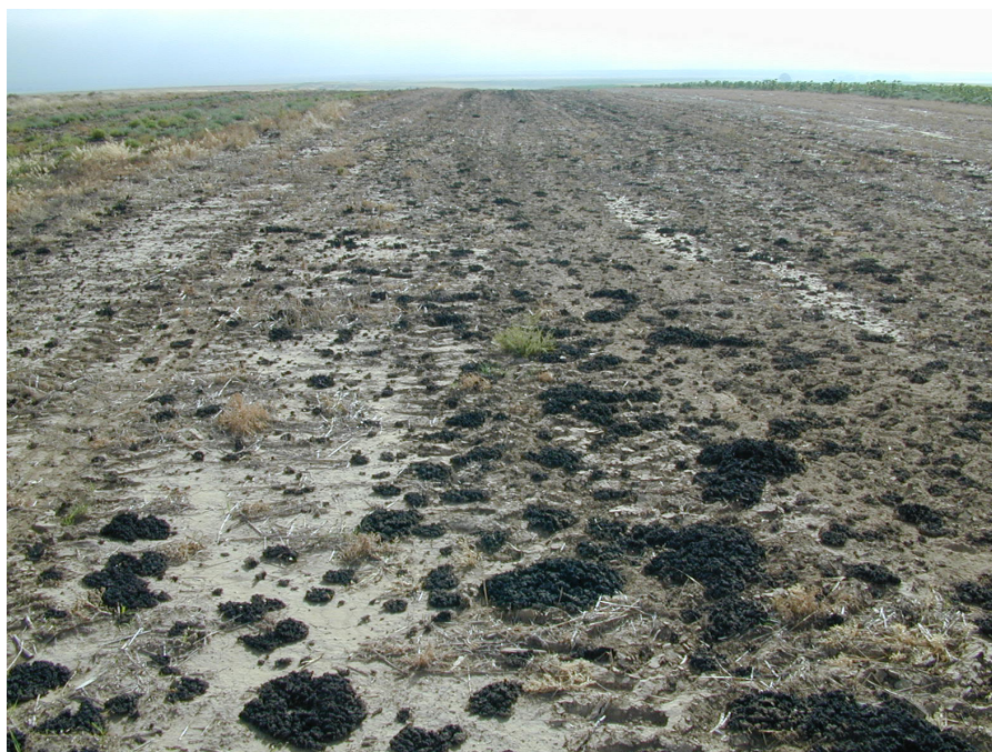
Field after application of biosolids at Colorado State University's Biosolids Research site in Byers, Colorado.

Among those contaminants of concern include so-called nanomaterials, materials that are engineered at the ultra fine molecular scale that display novel characteristics like increased strength or conductivity. In the study, "Soybean susceptibility to manufactured nanomaterials with evidence for food quality and soil fertility interruption," researchers found that biosolid application to soybeans caused zinc oxide nanoparticles to bioconcentrate in soybean tissues, especially the leaves, and that nano-cerium oxide completely shut down nitrogen fixation. "Juxtaposed against widespread land application of wastewater treatment biosolids to food crops, these findings forewarn of agriculturally associated human and environmental risks from the accelerating use of MNMs [manufactured nanomaterials]," the study finds. 17