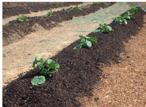
Pumpkin seedlings planted out on windrows of composted biosolids at community compost education garden.

For example, cadmium accumulation varies distinctly in different plant types, but is regarded as the most hazardous metal element based on its concentration in sewage sludge. In the short-term, ingesting high levels of cadmium residues can cause vomiting and stomach irritation, but prolonged exposure to low levels can cause kidney damage and bone fragility. 8 The Agency for Toxic Substances and Disease Registry cites research showing that cadmium tends to accumulate in plant leaves, and therefore is more risky, especially for leafy vegetables grown on contaminated soils. 9 Tobacco, lettuce, and spinach, are known to be particularly prone to cadmium absorption. Currently, the Standards for the Use or Disposal of Sewage Sludge 10 regulate the application of biosolids with concentration limitations for heavy metals—specifically for arsenic, cadmium, copper, lead, mercury, molybdenum, nickel,