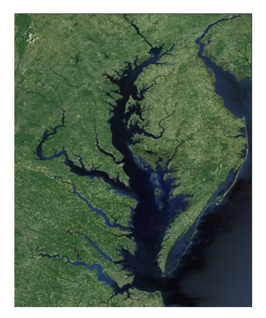
Image of the Chesapeake Bay

and monitoring that could be conducted to better define the extent and severity of groups of contaminants. It also focuses on the severity of adverse effects of toxic contaminants on natural resources in the Bay and its watershed. Legislation in the Maryland legislature, H.B.775 and S.B.675, would set up a pesticide use tracking system for farm and commercial pesticide use.