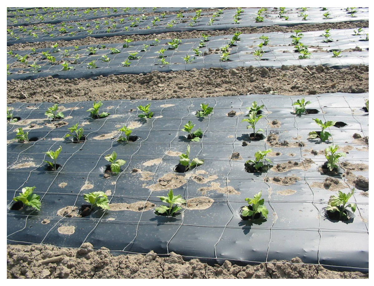
Bioplastic mulch films like the one above (which is a PLA-Blend Bio-Flex) closely resembles petroleum-based mulches. However, instead of being collected after use, mulch films are tilled into the soil and under ideal conditions decompose into water and carbon.

research that showed inconsistent biodegradability. Biobased mulch films work in a similar way to petroleum-based polyethylene mulch films and are considered to be more environmentally friendly because of their degradation to carbon and water under ideal conditions and proper soil incorporation. The plastic is used to inhibit weed growth, raise soil temperatures, and conserve water. Indeed, mulch can also allow crops to mature earlier, produce higher yield, and improve resistance to insects and diseases. However, unlike petroleum-based plastic products, which under organic law must be removed at the end of the season and landfilled or recycled, biobased mulch films must be tilled into the soil to achieve 90% biodegradation, as required by the new NOP rule. While it is considered to lower labor costs, eliminate landfill costs, and reduce the carbon footprint of organic farms, its complete biodegradation has come into question and requires more guidance as to where, when, and how it can be used without violating the intent of OFPA.