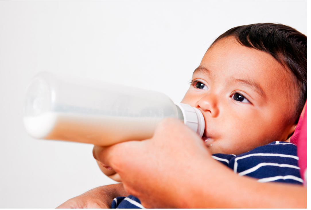
Numerous synthetic additives have been allowed in infant soy formula labeled as organic, while the National Organic Standards Board (NOSB), has recommended removal of seven.

The push to eliminate nonessential ingredients was further advanced by a series of proposals on organic infant formula. Beyond Pesticides supported their elimination, as they are synthetic macronutrients that are not compatible with organic principles. Additionally, the use of synthetic antioxidants as preservatives in organic food is explicitly prohibited in section 205.600(b)(4) of the organic rule, leading to the rejection of the chemical antioxidants ascorbyl palmitate and beta carotene (Vitamin A), which are used to preserve the quality of polyunsaturated fatty acids.