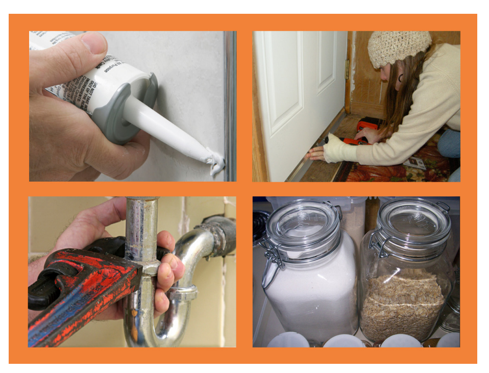
These images are all part of a sound IPM strategy to prevent and eliminate cockroaches. Clockwise from top left: caulk gaps and holes to keep pests out; install weather-stripping to eliminate entry points; repair leaky pipes and other water sources, and; keep food in sealed containers.

extremely helpful. Any leaky faucets or drains should be repaired, and any moisture producing pipes should be insulated. Additional cultural controls such as attentive vacuuming, not leaving food or crumbs out at night, immediately cleaning up messes, and refraining from