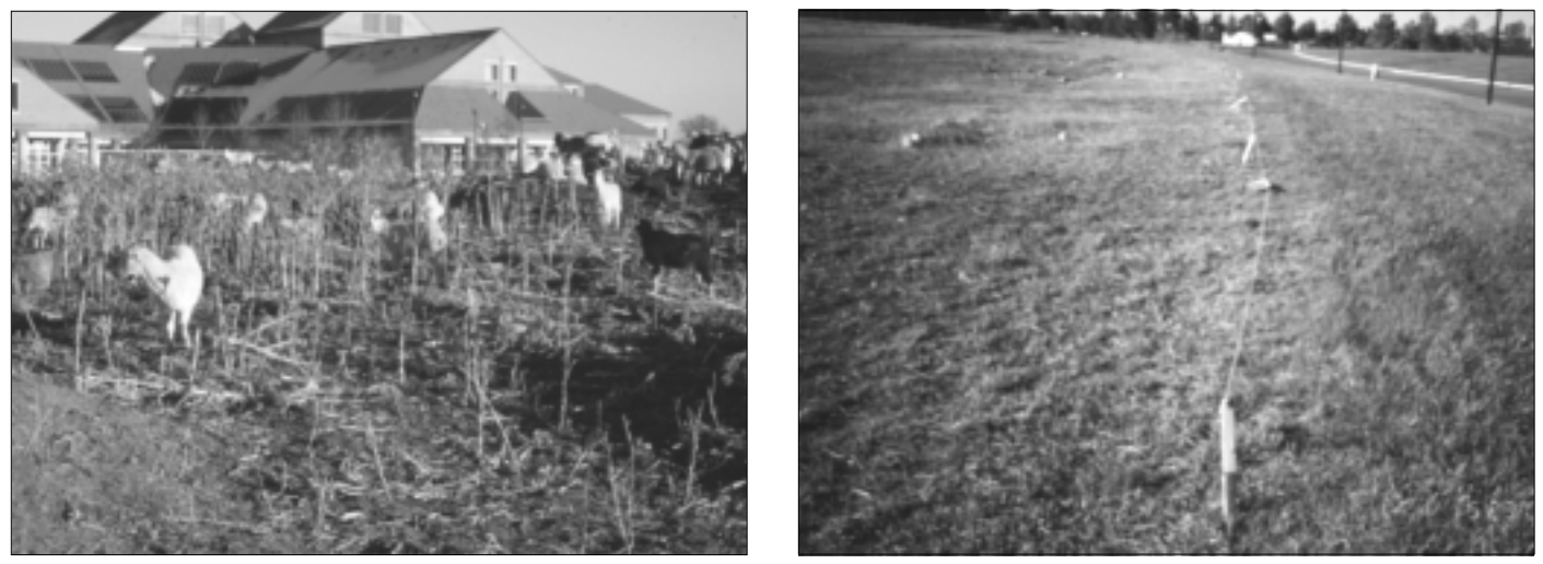
Goats grazing scotch thistle at the University of Colorado, Boulder campus grounds in late November 2000, left, stress the weed so much that grasses can successfully grow on the site the following May, right.

diffuse knapweed, the optimum time to graze is the first of June.