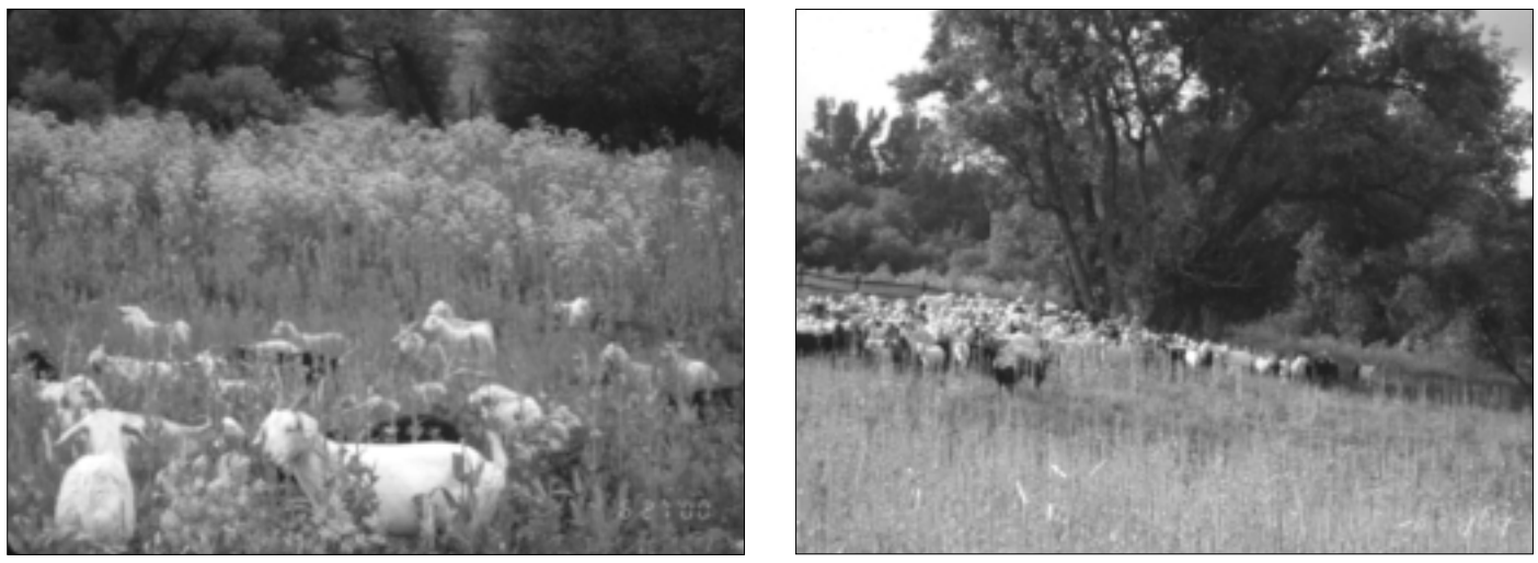
Teasel and poison hemlock grow so high, left, that the goats in the background are hidden. The goats eat the teasel and poison hemlock's flowers and leaves, allowing sunlight to reach the ground, right.