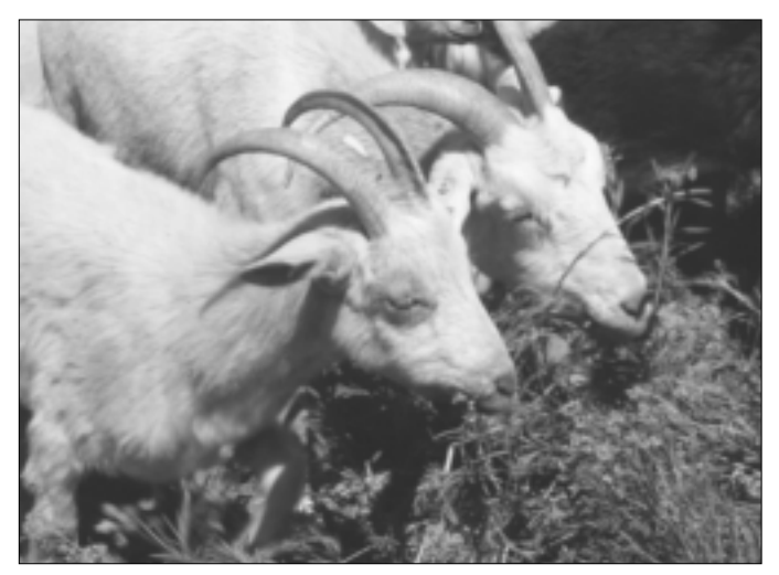
Goats prefer weeds to grasses. One of their favorites is leafy spurge.

One problem with using chemicals to control weeds is that they are trying to kill the symptom. Pesticides never take care of the problem. The problem is that there is a stress or a niche open on the land that needs to be filled with something good, something productive that you want.