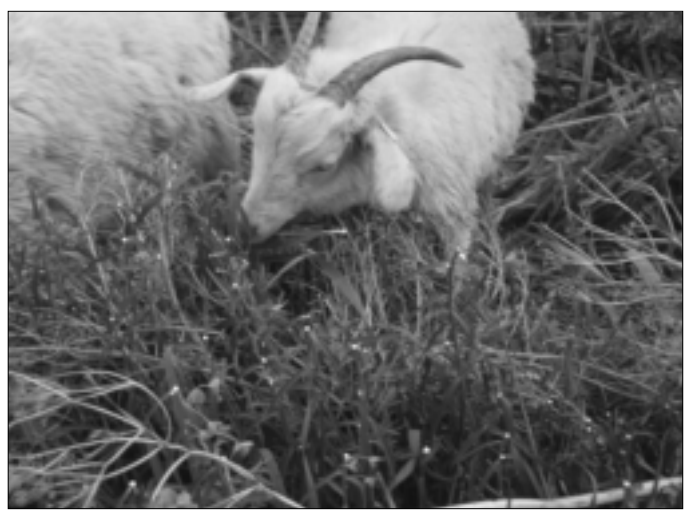
The white latex from leafy spurge oozes from where the goats have snapped off the tops of the plant. An enzyme in the goats saliva detoxifies the latex before they swallow it.

Timing of when to graze a weed is important to making the biggest impact. If wildflowers are your goal for the land, yet you have to control your noxious weeds by law, I would graze to stress the weed when the wildflowers were not yet in bloom. For