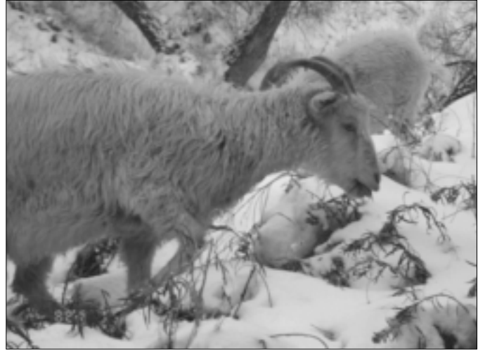
Goats can be used all year round to control noxious weeds. Here they dig out leafy spurge from under a snowdrift.