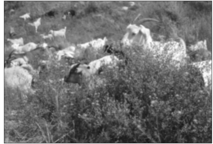
Goats graze a site covered with spotted knapweed.

The goats love Christmas trees, they clean it up, strip all the bark off. The remaining tree trunk could be sold to a youth group, to be cut, packaged and sold as firewood. So the recycling keeps going on and on through all levels of insects, birds, people and different groups of people.