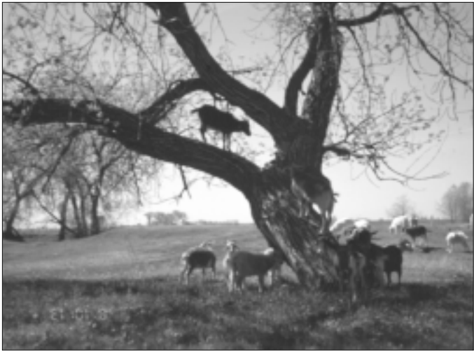
Goats will eat leafy spurge anywhere, even when it is growing out of the trunk of a cottonwood tree.

The extensive underground root system is also a spreading threat at the same time. Leafy spurge is capable of making an identical new plant far away from the mother plant. The root system goes down about 30 feet. It can grow in a crack in a rock, side of a cotton wood tree in the bark, or top of a cottonwood tree about 20 feet off the ground. What is the solution to leafy spurge in the cotton wood tree? Goats! Of course, leafy spurge is almost the goat's favorite food and they do climb trees.