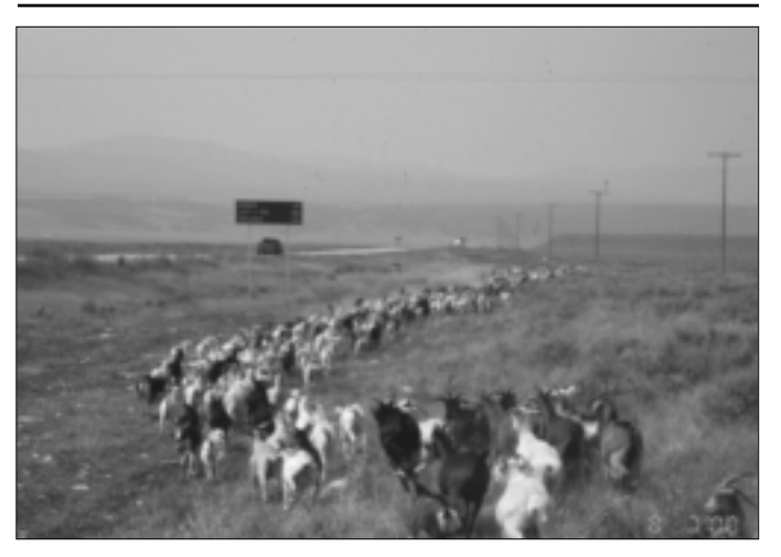
Goats graze a site covered with spotted knapweed.

Another way we handle the goats is by walking them. For one job, we walked 1,000 head of goats 35 miles down the right-of-way of Highway 287 on our way to a ranch in Enis, Montana. Every landowner along the way came out, saw what we were doing and hired us.